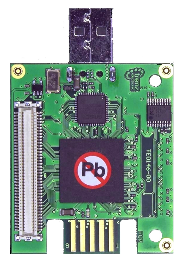
Figure 2: Micromodule with SDRAM