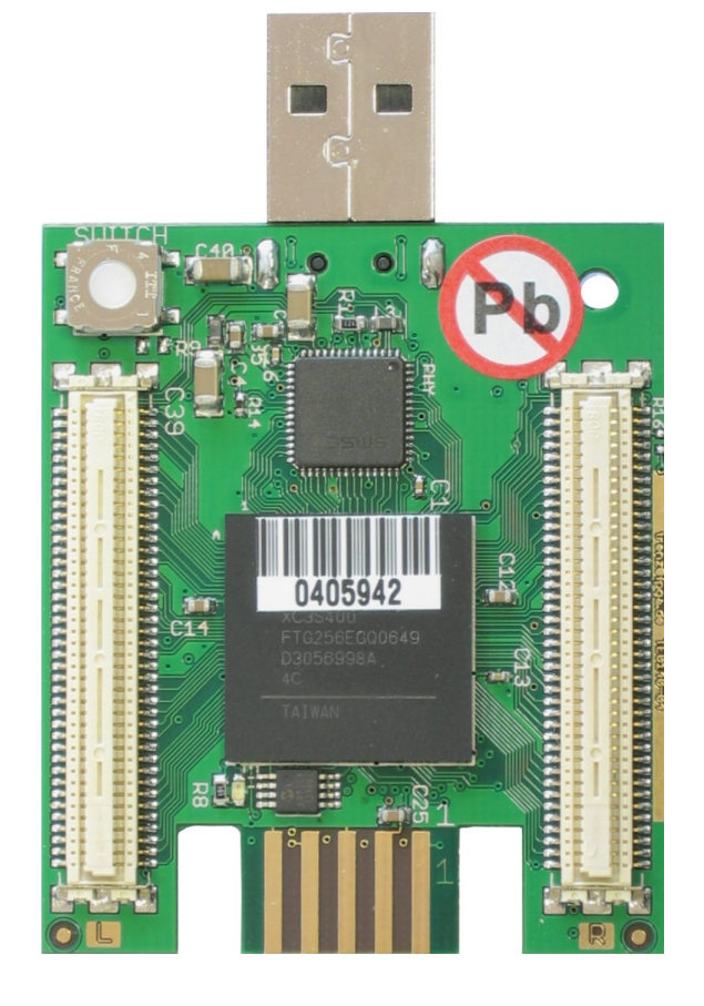
Figure 1: Micromodule without SDRAM