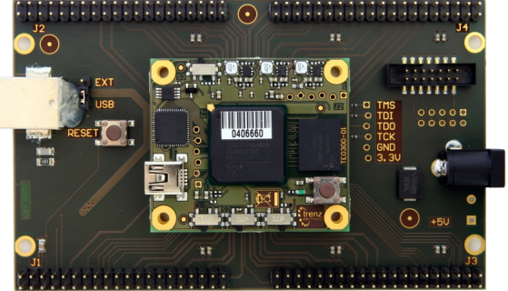
Figure 2: prototyping carrier board: top view with module.